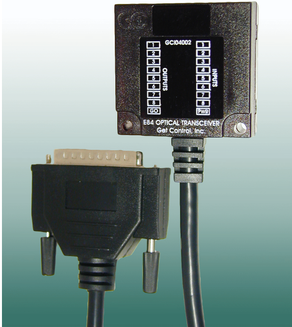
Figure 1- GCI04002